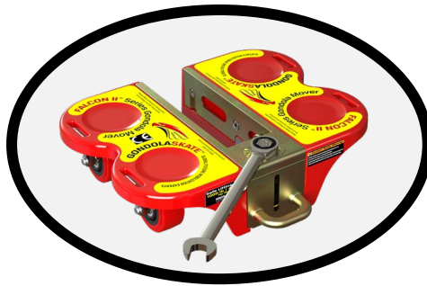
Integrated lift mechanism

Move multiple gondola bays at once with sturdy connector bars that prevent snaking and damage to the fixtures.